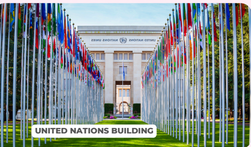
UNITED NATIONS BUILDING