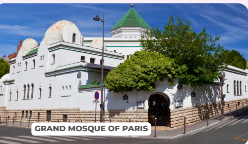
GRAND MOSQUE OF PARIS