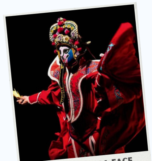
SICHUAN OPERA FACE CHANGING PERFORMANCE (ADDITIONAL TOUR)