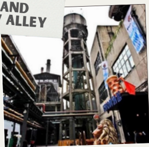
EASTERN SUBURB MEMORY