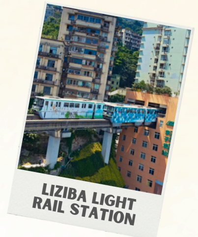
LIZIBA LIGHT RAIL STATION