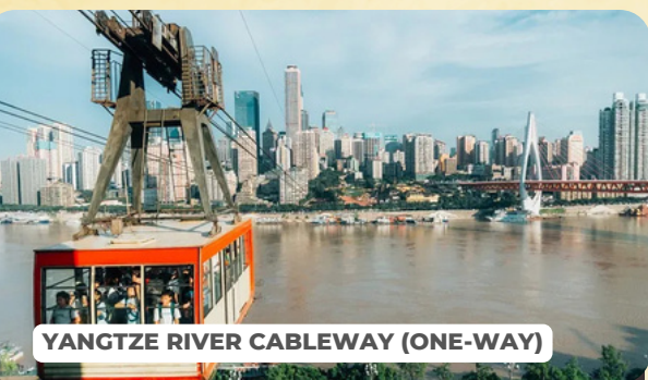
YANGTZE RIVER CABLEWAY (ONE-WAY)