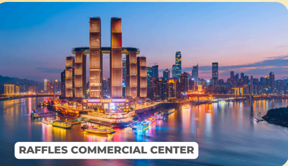
RAFFLES COMMERCIAL CENTER