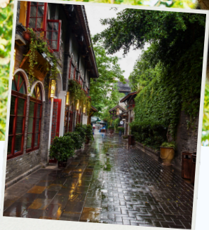
WIDE AND NARROW ALLEY