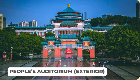
PEOPLE'S AUDITORIUM (EXTERIOR)