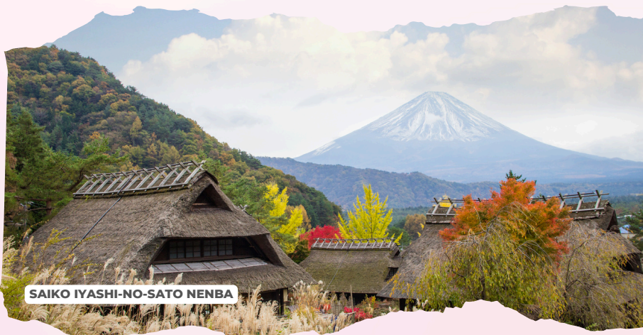
SAIKO IYASHI-NO-SATO NENBA