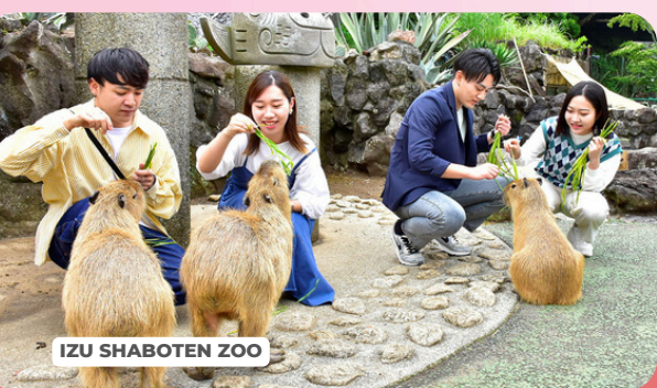
IZU SHABOTEN ZOO