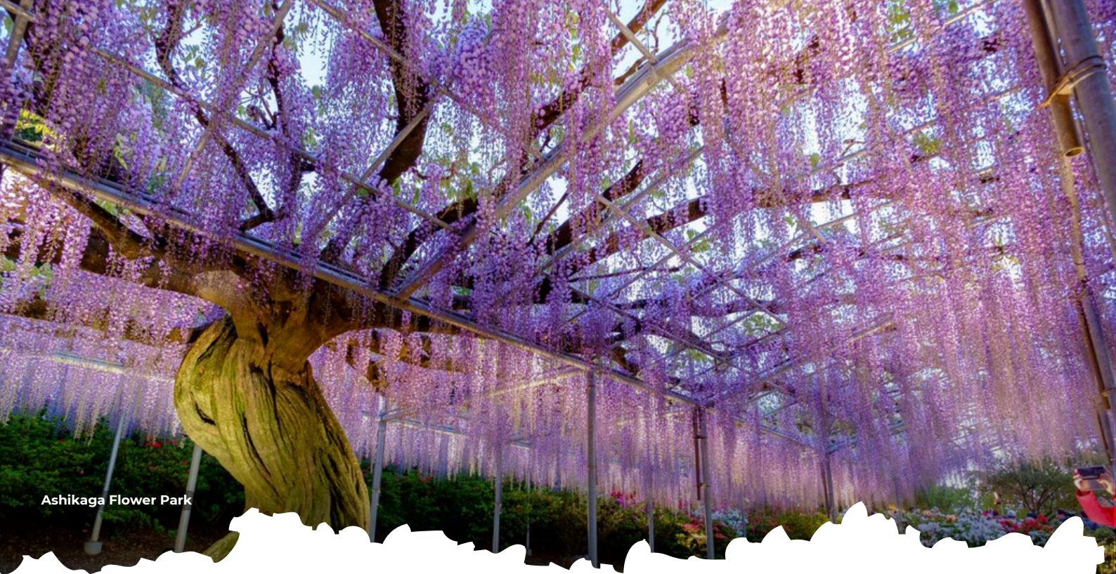
Ashikaga Flower Park