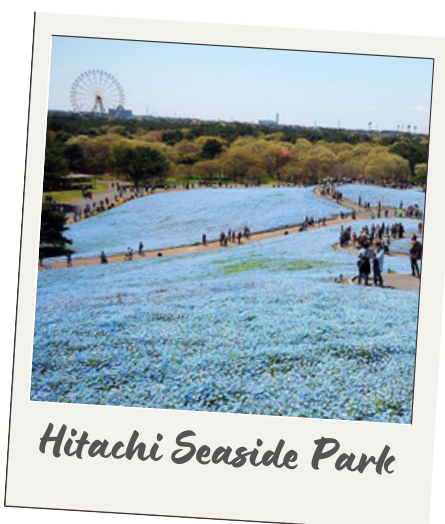
Hitachi Seaside Park