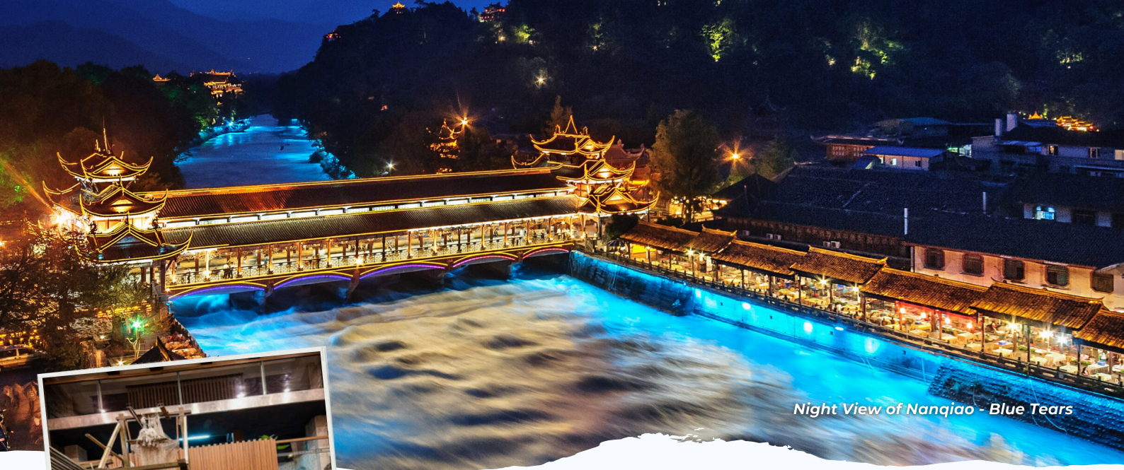
Night View of Nanqiao - Blue Tears