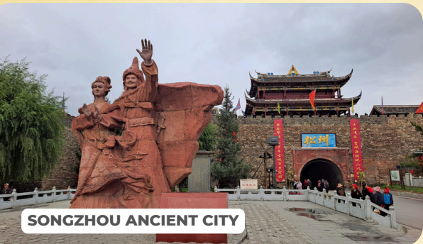
SONGZHOU ANCIENT CITY