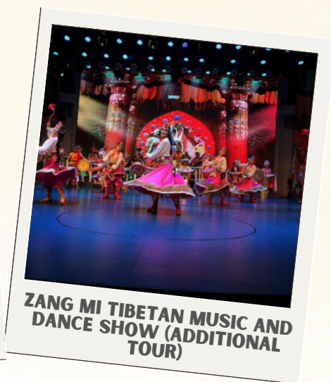
ZANG MI TIBETAN MUSIC AND DANCE SHOW (ADDITIONAL TOUR)