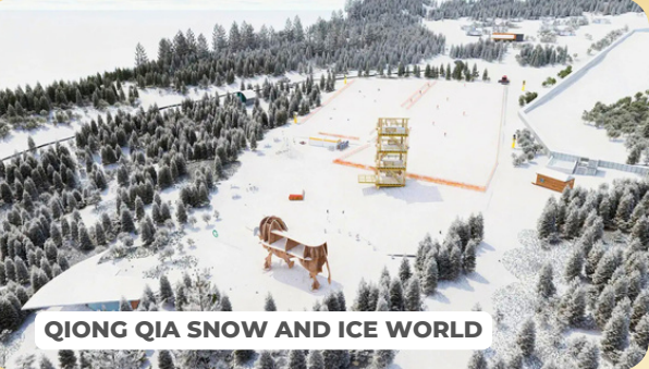
QIONG QIA SNOW AND ICE WORLD