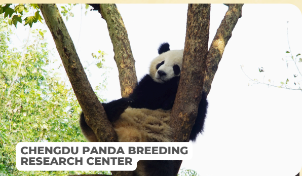
CHENGDU PANDA BREEDING RESEARCH CENTER