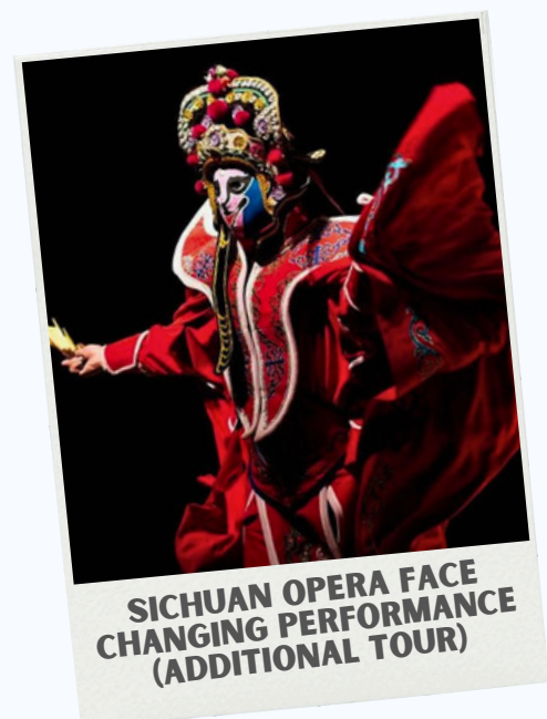
SICHUAN OPERA FACE CHANGING PERFORMANCE (ADDITIONAL TOUR)